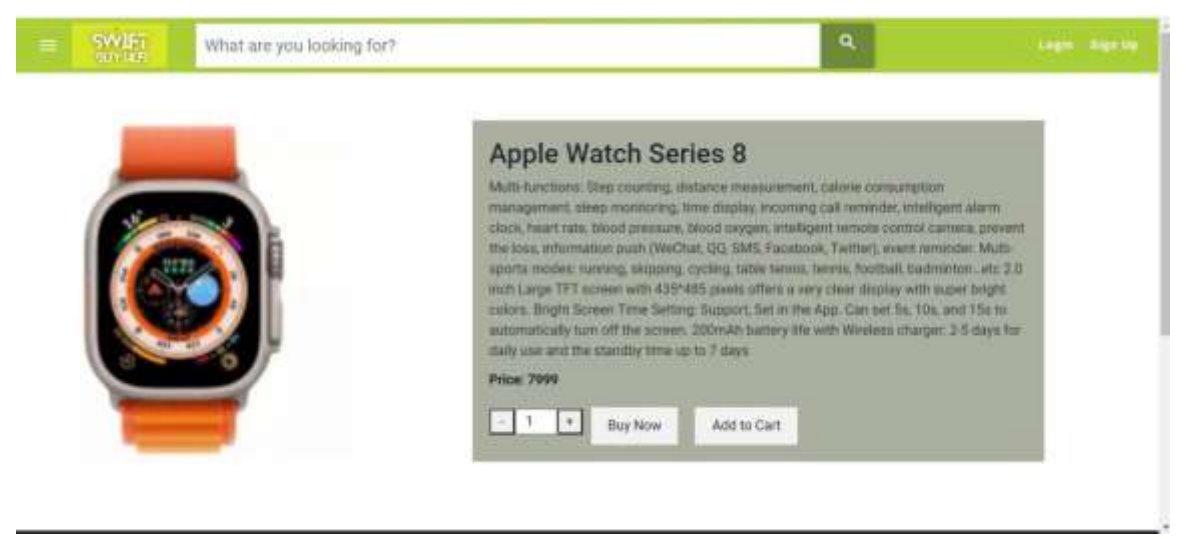
Fig 3(Product view)